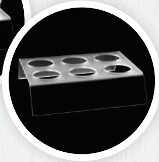
Frosted 6PC Shot Glass Tray (BTSH2X3F)