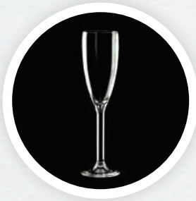
170mL Champagne Flute (BTC170)