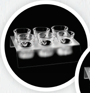
30mL Certified Shot Glass (BTS030H)