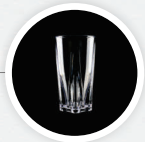
355mL Certified Beer Glass (BTB355)