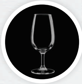
200mL Riviera Wine Taster (BTFW200T)