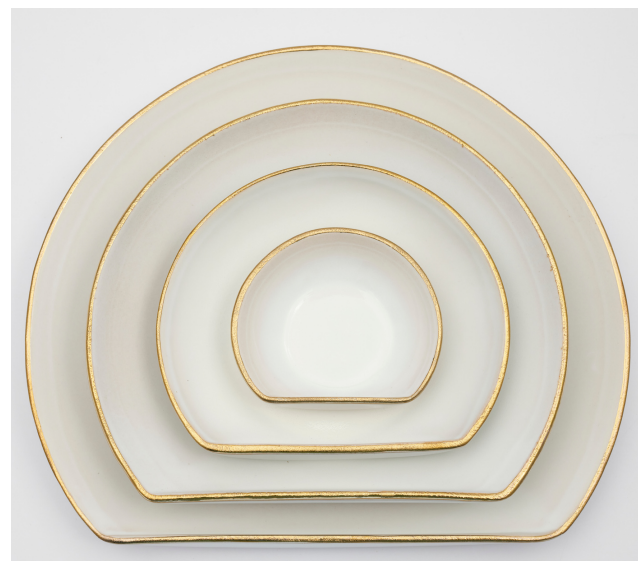
Ivory & Gold