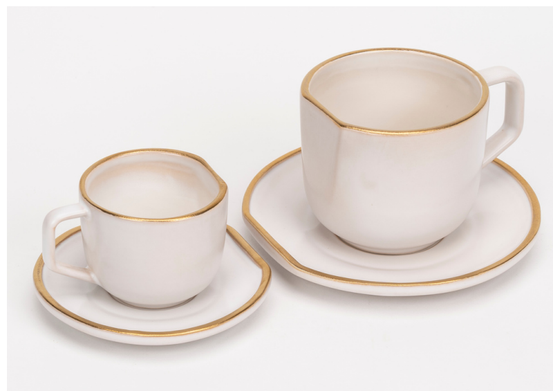
Ivory & Gold