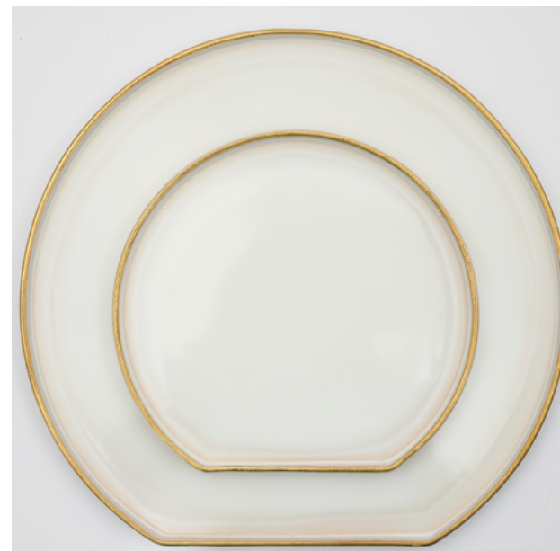
Ivory & Gold