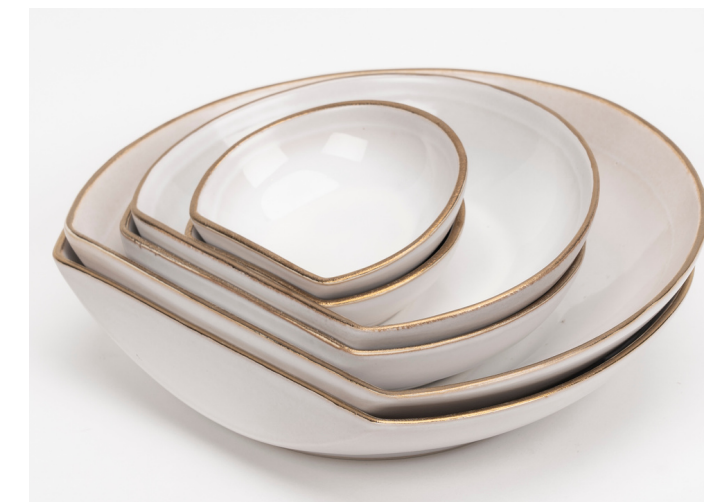
Ivory & Gold