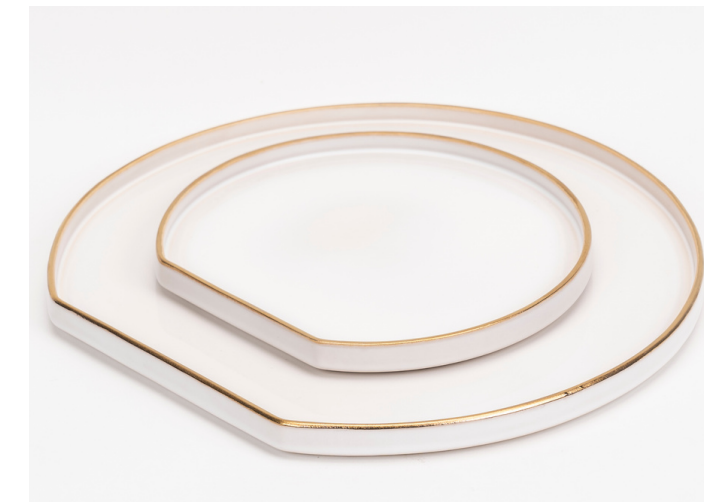
Ivory & Gold