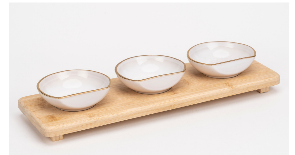
Ivory & Gold